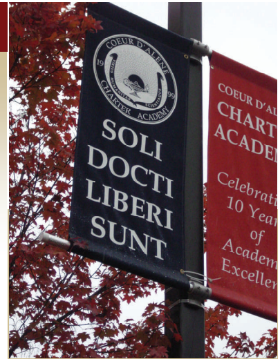
Dan Nicklay, Principal

This plan is not an obstacle to be overcome; think of it as a new operating system!