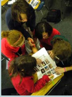
Students looking at the first set of yearbook proofs, before they go to the plant to be finalized.